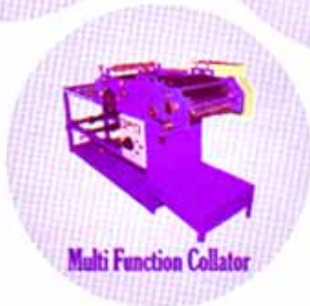
Multi Function Collator