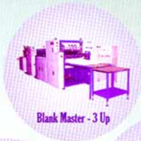
Blank Master - 3 Up